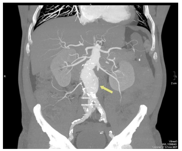
Fig. 8 MIP-reconstruction, the frontal plane, the arterial phase. Aneurysm of the abdominal aorta.

CT of abdominal cavity and retroperitoneal space (spot imaging of the abdominal aorta): Deformation of abdominal aorta, with an angular bend in the infrarenal section. At a distance of about 4.4 cm distal from the mouth of renal arteries - aneurysmal expansion (Fig. 8) over a length of about 5.6 cm (due to the protrusion of the posterior and left lateral wall), with a maximum diameter of 6.7 cm. The formation of the inferior vena cava is observed at the renal level of the aorta through merging of the common iliac veins (with the renal veins ending in them) - Fig. 9, 10.