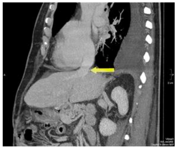
Fig. 6 MIP-reconstruction, the sagittal plane, the venous phase.

Hepatic veins ending in the right atrium.