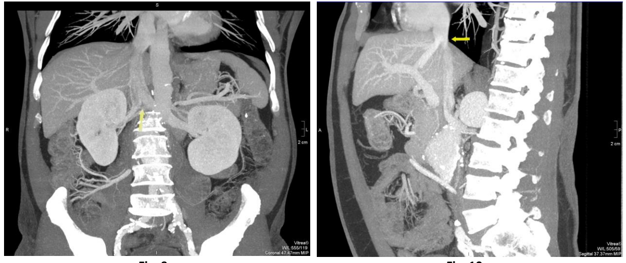
Fig. 9 MIP-reconstruction, the frontal plane, the venous phase.