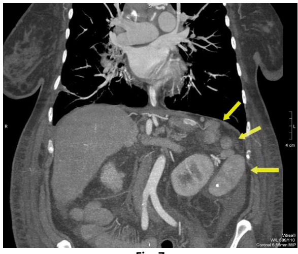
Fig. 7 MIP-reconstruction, the frontal plane, the arterial phase. Polysplenia (multiple spleens).

An important aspect of the clinical example is that the possibility of simultaneous expansion of areas of interest during the CTA ensured identification of the abnormality, as well as evaluation of its character without using any special methods of image contrast enhancement for the investigation of the IVC, along the entire length without increasing the duration of the study, subject to the critical condition of the patient.